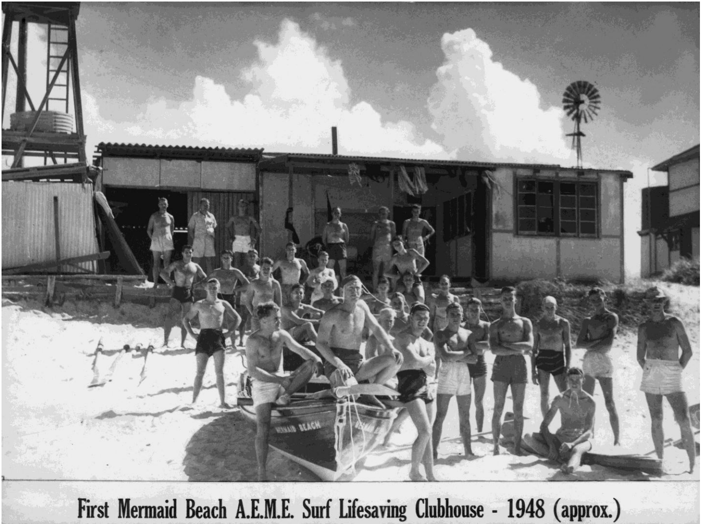
First Mermaid Beach A.E.M.E. Surf Lifesaving Clubhouse - 1948 (approx.)

The first Mermaid Beach AEME Surf Life Saving Club, 1948. Located on the sand dunes at the end of Ocean Streets, Mermaid Beach.