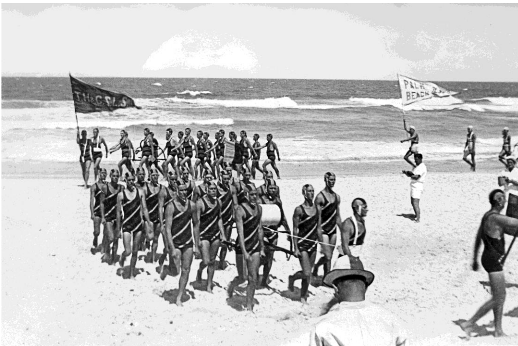
1 st Carnival held at Mermaid Beach on 16 th March 1947. Teams were competing for the Parkes Challenge Shield.