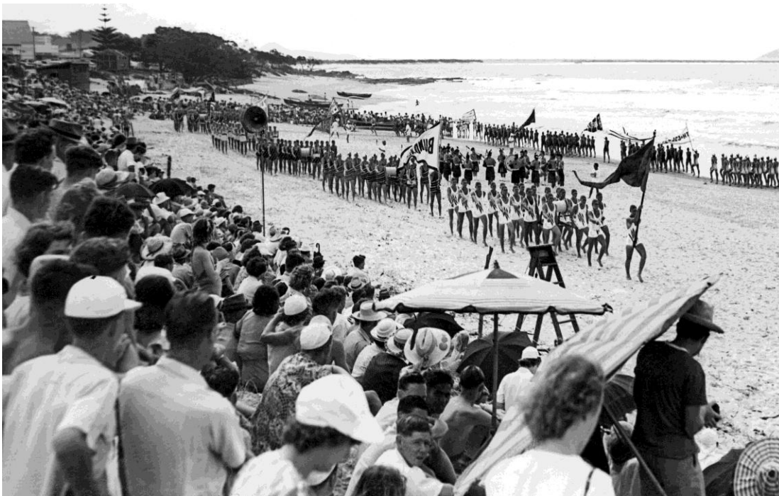
Mermaid Beach AEME SLSC team winning the QLD March Past Title at Mooloolaba 49/50.