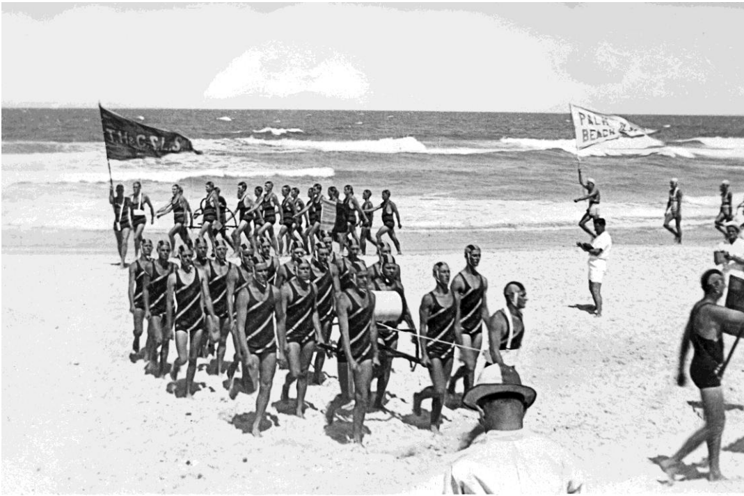
1 st Carnival held at Mermaid Beach on 16 th March 1947. Teams were competing for the Parkes Challenge Shield.