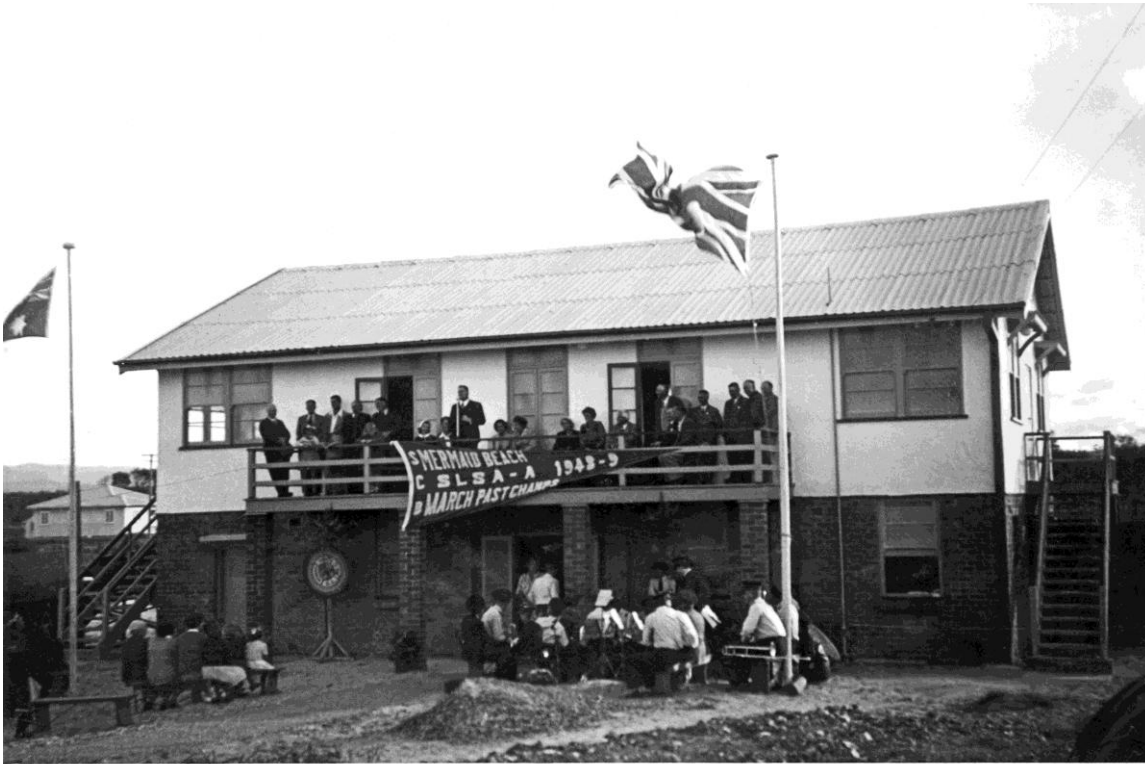
Opening Second Club House 1951/52 by Jack Duggan Dep. Labor Premier Qld

Second club house, which sits on our current location, was opened on the 3 rd May, 1952 by Jack Duggan. Dep. Labour Premier of Qld.