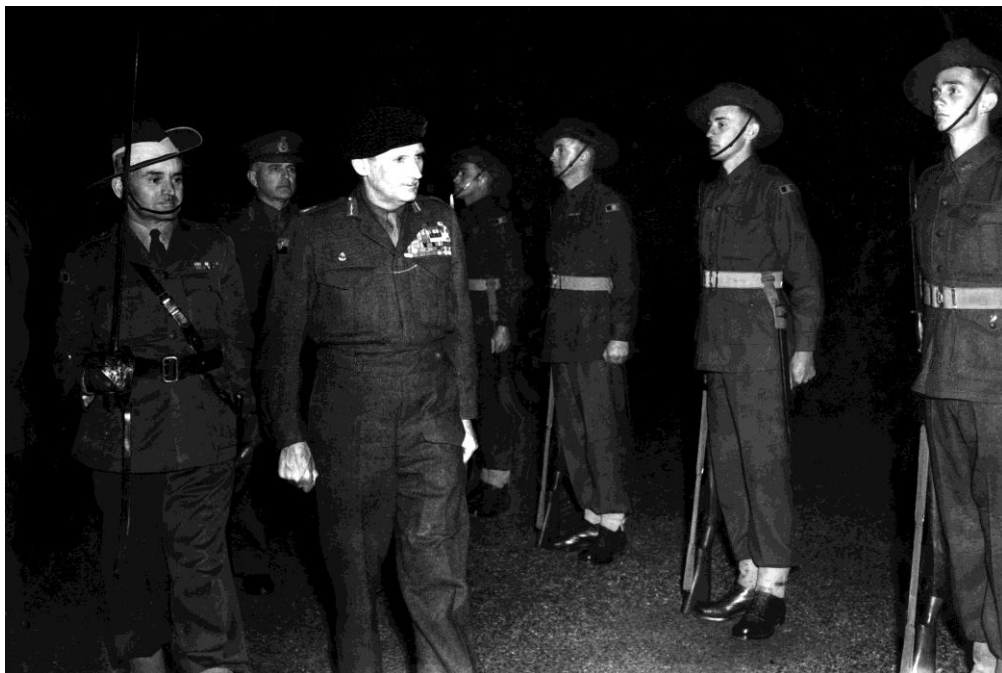
Field Marshall Montgomery inspecting the troops from the Australian Electrical and Mechanical Engineers on his visit to Australia in 1945.