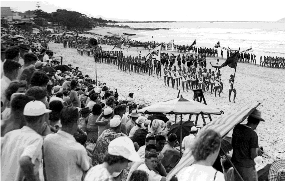
Mermaid Beach AEME SLSC team winning the QLD March Past Title at Mooloolaba 49/50.