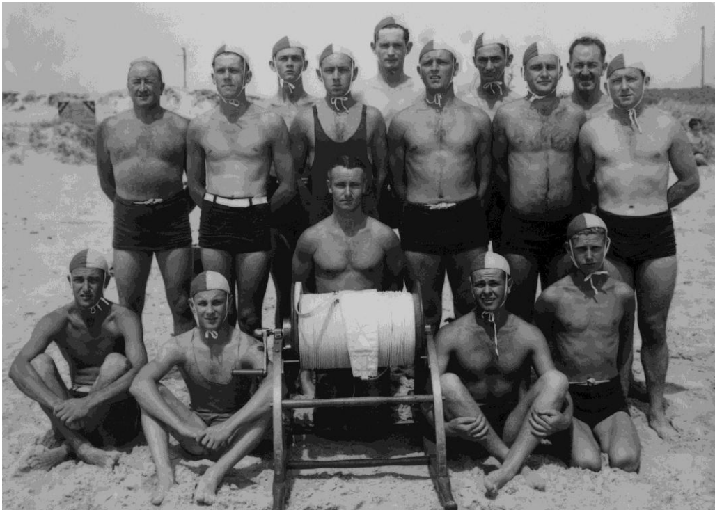
Our 1 st active patrolling members.