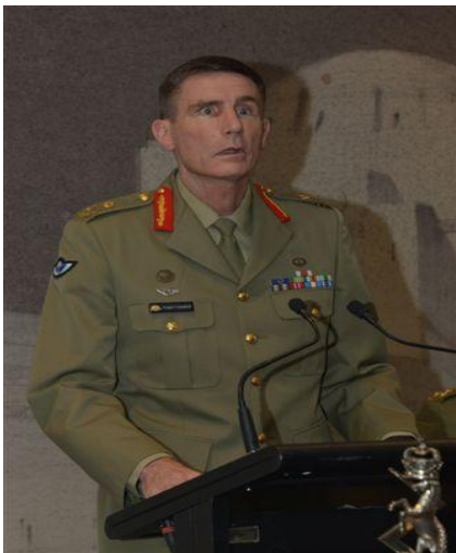
Chief of Army, LTGEN Angus Campbell, thanking the Project Team and the HOC on a job well done