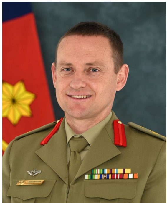
BRIG HADYN KOHL – HOC RAEME 2015

FROM THE NEW HEAD OF CORPS (HOC) – BRIG HADYN KOHL