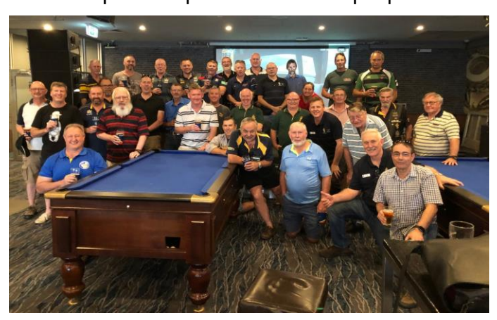
Local members enjoying a relaxing couple of hours at the RAQ gathering at the Dalrymple Hotel

which meet the needs of local members. Importantly, RAQ also agreed to accept previous NQ Life memberships where proof of membership is provided.