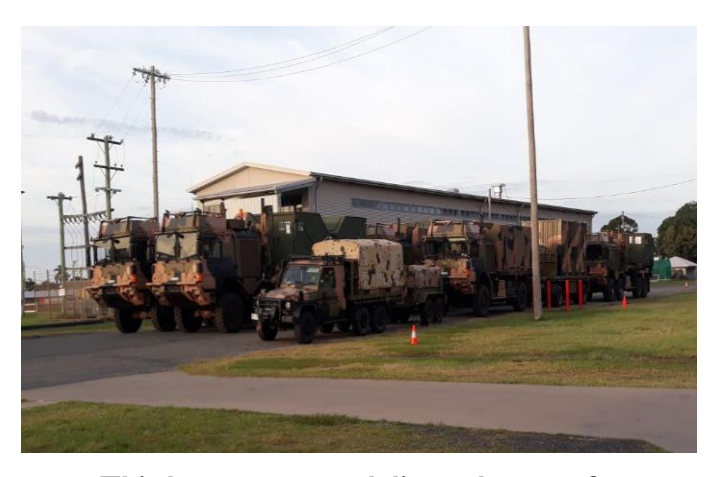
This heavy convoy delivered stores for embarkation on LHD HMAS Adelaide at Fleet Base East ready for Ex Sea Series.

The Troop will see the year out continuing to support driver training, in barracks, and yet another phase of Taipan Gun Mount trials. Our sights are now firmly fixed on 2020's main logistic activity: Ex Hamel 2020.