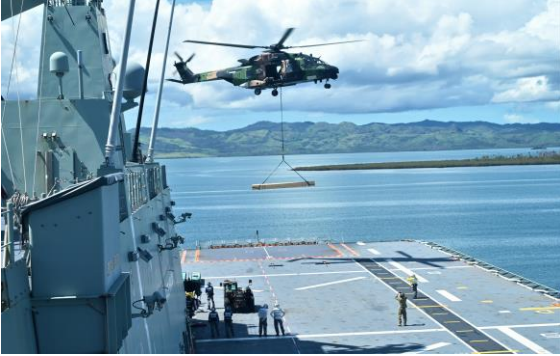
Transporting construction supplies as an underslung load with an MRH-90

An important milestone was achieved involving the first deployment of Army specialist technicians since the introduction of the Aero skills Technician Specialist (ATS) scheme in 2020. The four specialist technicians were provided greater maintenance flexibility, as they were able to act as a supervisor in their core trade, whilst conducting technical tasks in their secondary trade.