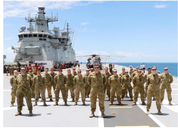
Embarked TST aboard the deck of HMAS Adelaide

TU TAIPAN reconstituted back in Townsville on 3 Feb 21 after completing two weeks of mandatory quarantine post the operation. The personnel involved have since settled back into the 5 Avn Regt battle rhythm after a period of well-earned leave.