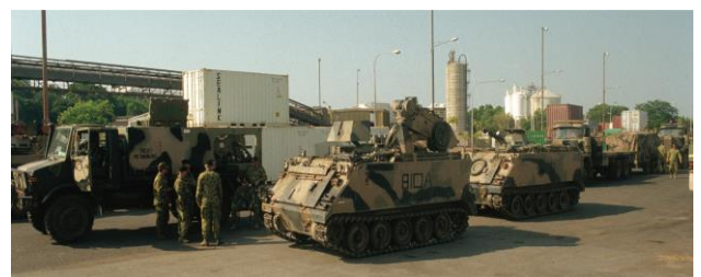
In Darwin Ready to Go!

Two of 1 Troop's Armoured Personnel Carriers (APC) were airlifted to Darwin, to form part of the air assault group to fly into Dili with C Company 2 RAR. The remainder of the troop made an early road move to Darwin while the rest of the Squadron moved by road a little later. 1 Troop's road element arrived in Darwin safely and waited its turn to be lifted across the water. We spent that time billeted in the transit compound of Robertson Barracks with the New Zealand Battalion.