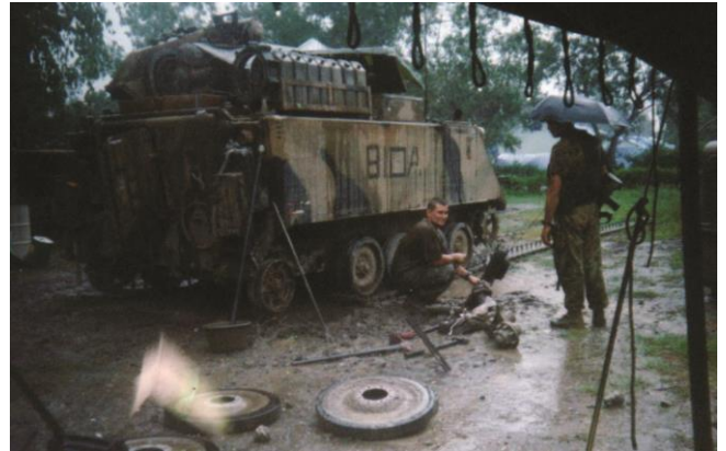
B Sqn location in Balibo swamp – umbrellas are useful in many circumstances.

Luckily life in the Battalion area was short-lived for I Troop, as the AI echelon, was eventually sent out on patrol support tasks.