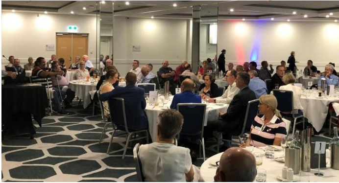
Wonderful setting, service and meal at the Maroochy RSL.

RAQ Sunshine Coast Annual Luncheon – Sat 11 Sep 21. This year's RAQ Sunshine Coast Chapter Annual Luncheon was again successful with attendance numbers being maintained despite Covid. 69 guests registered this year compared with 65 last year but sadly still down on our highs of 80-90 pre-Covid. The organisers were pleased with the resulting attendance and all the feedback has been very positive.