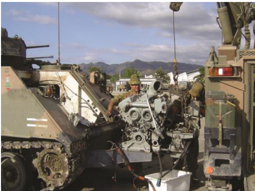
New power pack has arrived and is about to be installed.

Our four ‘cars’ formed the basis of the Battalion Group’s AI Echelon. Being a member of the AI Echelon had its risks, not so much from the enemy, but by being isolated from the main group. Three M113s became unserviceable with engine failures with only limited second line support available from Dili. Due to the urgency of getting these vehicles back on the road, a prompt response was required.”