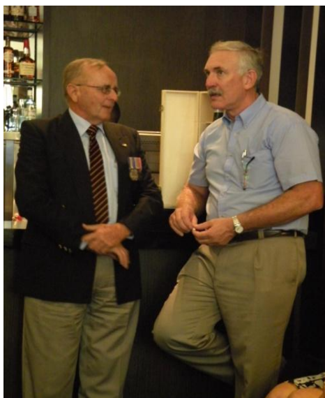
Association Chairman and Treasurer in Deep Discussion about ANZAC Day