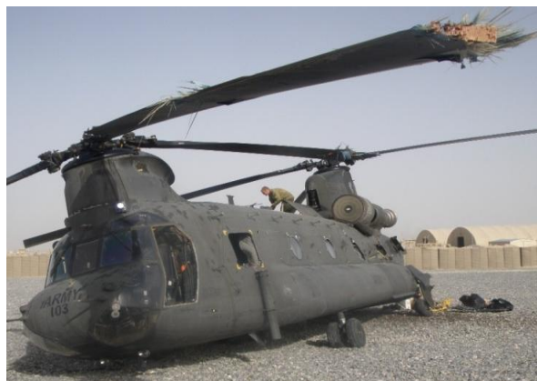
Crusader’s “Gone Down” A15-103.

“22 June 2012 started like any other day, but in the early hours of the morning, Rotary Wing Group 7 (RWG 7) was advised that A15-103 had ‘gone down’, sustaining minor damage. Immediate concern was for the crew’s safety and to understand the extent of damage to the aircraft. Dozens of scenarios raced through our minds until the damage reports were received by radio from the Kandahar Airfield (KAF) Tactical Operation Command (TOC).