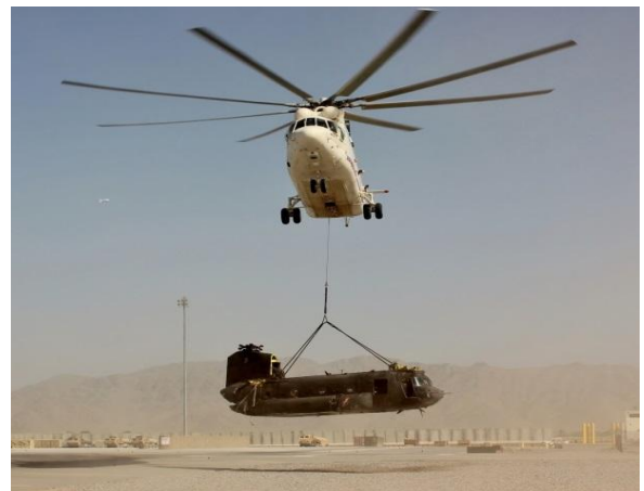
A15-103 during last hover

The hidden structural damage proved worse than initially assessed, which immediately placed the recovery mission at risk. The options available were very clear cut at that stage; postpone the mission; cut away or remove the damaged structure; or find a means of supporting the failing structure. After much deliberation and hasty rudimentary calculations, the failing airframe structure was 'tied' back into the solid bulkheads located directly above the fracture line using heavy duty military cargo straps.