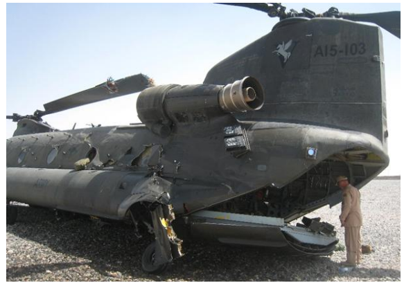
A15-103 in situ, emphasising failed landing gear

Strict time constraints, 50 degree heat, frustrating coalition logistical issues, airframe structural integrity concerns and a numerically limited workforce contributed to what seemed to be an insurmountable task to prepare the aircraft for timely aerial recovery. If we failed to use the contracted aircraft to recover the aircraft, there was a potential delay of up to eight days, which could significantly impact mission outcomes.