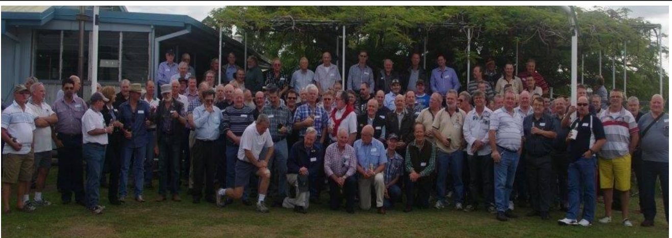
Army Apprentices Annual Reunion 8 Jun 14 – All Attendees