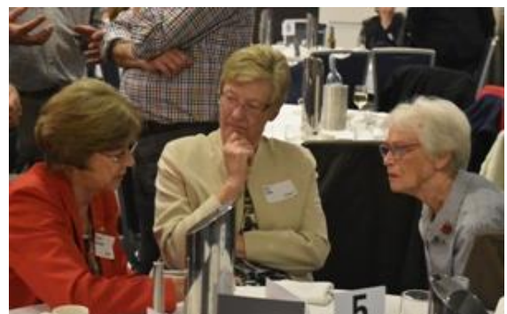
More earnest conversations