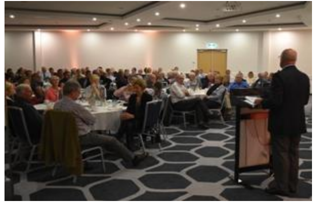
The gathered multitudes