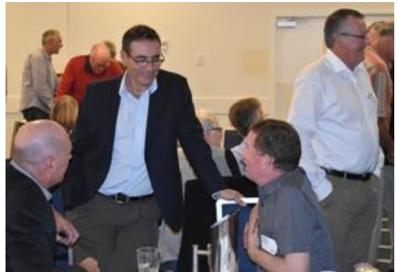
COL COMDT-QLD in earnest conversation