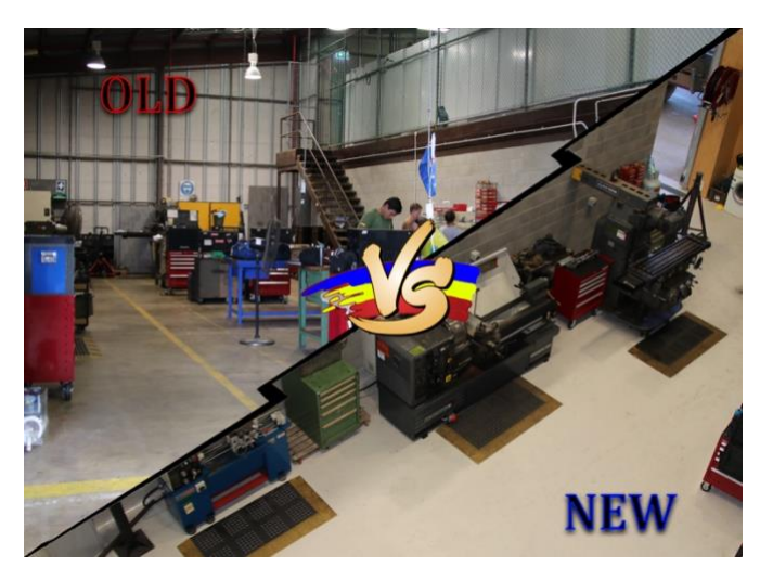
CFN Christopher Reid

Overall, the new workshop facility will help build morale, steering the productive activities of the tradesmen in the right direction. Importantly, the new facility provides a better capability and builds stronger esprit-de-corps as a whole to better "Fight, Support and Enable."