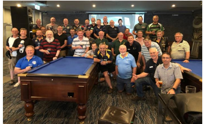
Local members enjoying a relaxing couple of hours at the RAQ gathering at the Dalrymple Hotel

which meet the needs of local members. Importantly, RAQ also agreed to accept previous NQ Life memberships where proof of membership is provided.