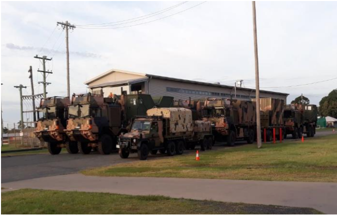
This heavy convoy delivered stores for embarkation on LHD HMAS Adelaide at Fleet Base East ready for Ex Sea Series.

The Troop will see the year out continuing to support driver training, in barracks, and yet another phase of Taipan Gun Mount trials. Our sights are now firmly fixed on 2020's main logistic activity: Ex Hamel 2020.