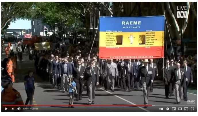
ANZAC Day March Brisbane 2021 (Click on the image above to view the parade)

The streets were lined with thousands of cheering Brisbane residents, supporting what was one of the most remarkable parades held in recent years.