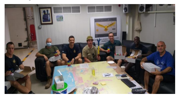
Once again thank you for the Spanner Packs - they were well received and much appreciated.

I have included a photo of the boys with their packs, you will notice we are not solely an ARMY team as we are a combined unit, and for the Workshop, we are a mix of Army and RAAF spread across two workshops maintaining the regular suite of Army equipment (weapons, Bushmasters, and a variety of electronic equipment) as well as Ground Support Equipment for the flight line.