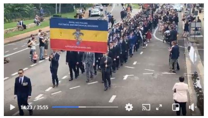
The New RAQ Banner proudly flying in the Townsville March (Click on the link)

Townsville Commemorations . Townville also saw large numbers of attendees turn out to commemorate in ANZAC Day in North Queensland. Despite some rain leading up to event, the skies held clear for the Gunfire Breakfast at Flynn's Hotel and the parade along the Strand which kicked off at 09:00hr.