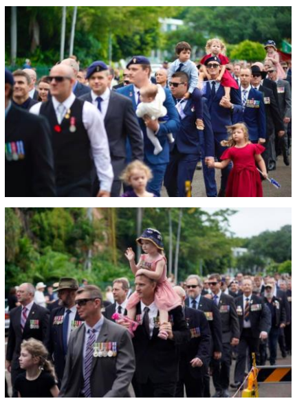
March participants in Townsville

The RAQ NQ had over 110 members and guests attend the Townsville parade and proudly marched behind our new RAQ Association NQ Banner.