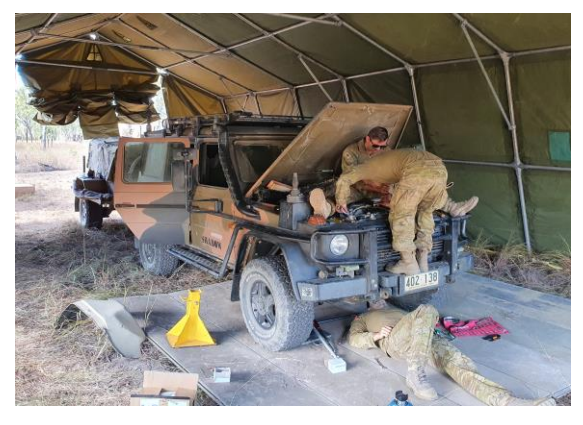
Head down a#*&# up as usual

With the Command Post Modules on G-Wagon 6x6, housing many radios and communications equipment, providing power to the Bn HQ and all subunit Coy HQ was EIR PLs priority. The electrical power plan required the laying of multiple 35kg cables and distribution boxes to a radius of 300 metres from the generators in many directions, through medium density vegetation and over undulating ground. This was exhausting work for LCPL Russ Penn and his team of three "elecies". Even with extra manpower to drag cables and set up the FPDS, the team worked well into the night to meet the units' needs.