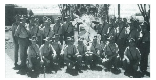
Victims of the Corps' restructure – the last contingent of RAEME Clerks and Storeman to be trained. This group transferred to RAAOC with effect 1 Jan 95.

constant. Base workshops battalions were subsumed into logistic battalions and groups. 3rd Line units, including many Army Reserve units, were disbanded or integrated. Field workshops were absorbed into Brigade Administrative Support Battalions (BASB), and later transformed into Combat Service Support Battalions (CSSB). Integral units at 1st line were also restructured, retitled and re-focussed to deliver maintenance support within in units with increased equipment dependencies incorporating new technologies.