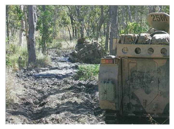
The unrecoverable meets the undaunted

After an eventful reconnaissance, in which the recovery vehicle threw a track, the location of the two "crocks" was confirmed – stuck in glutinous mud on a difficult and sodden slope. Scrub and fallen timber were cleared and the trapped vehicles prepared for recovery. With the assistance of scrounged towropes and tackle, the vehicles were eventually extricated from their muddy prison after a full day's effort and driven to safety to the relief of everyone especially the CO!