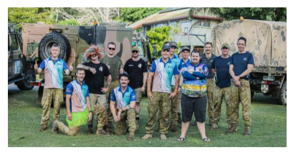
The crew, after washing the rally competitors cars for charity donations at Airlie Beach