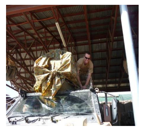
CFN Terzo covering partially installed PWS

The FIT's resistance was primarily based in a desire to train tradesmen on the ground, who would be responsible for future work on the systems. A distinctly separate component of FIT tasking was to facilitate training of MTF and SOTG personnel on the systems installed in the upgrade. This included operator training for all systems and some maintenance training specific to the upgrades. A compromise was eventually reached. It involved the electronics upgrade being completed by DMO subject matter experts with support from RAEME tradesmen who had a mandate to train tradesmen on the systems. As the work progressed and processes became bedded down efficiencies were identified by team members leading to Spanner News