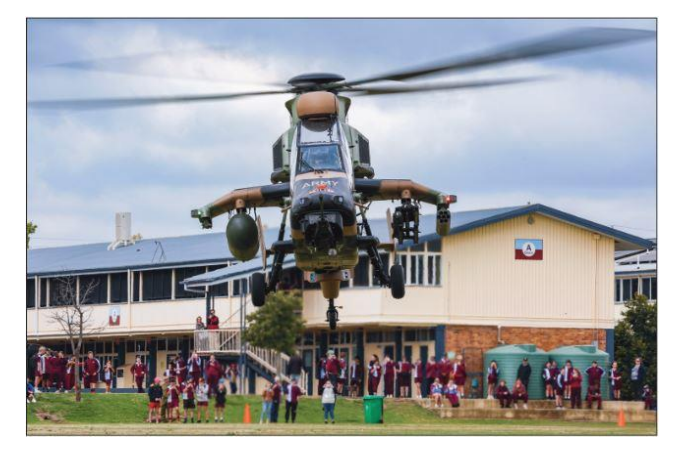
The ARH Tiger lifts off from the school oval for a return flight to Oakey Base

After students observed the aircraft displays in the carpark, they made their way to the school oval where they waited in anticipation for the arrival of yet another aircraft the ARH Tiger. Flying in, the ARH Tiger helicopter landed on the oval on time at 1.00 pm, where crews completed a typical training exercise for the students to see.